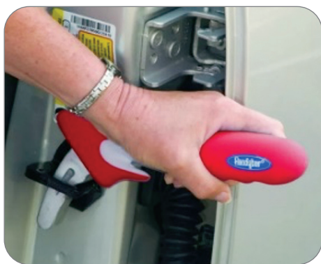
This “Handybar” can be placed in the door jam to create a handle for getting in and out