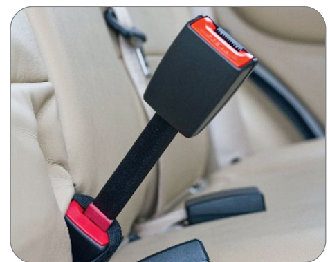
A seatbelt extender can be used to make it easier to buckle the seatbelt

If you use a mobility device, there will be extra considerations and the best thing to do is work with a physical or occupational therapist to practice a safe technique that is tailored for you.