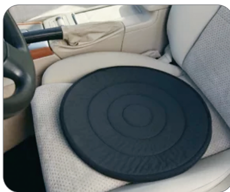
A Swivel seat or large plastic bag covering the seat can make turning in the seat easier