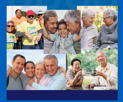
Publications also available in Spanish and Simplified Chinese.

Scan the QR code to download or order our publications so you can feel empowered, prepared, and supported.