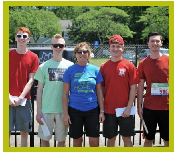
Congratulations to this year's scholarship recipients!