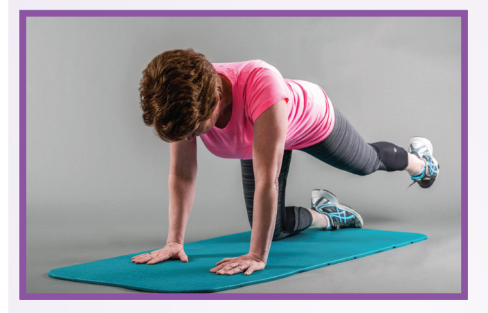
One leg: Raise your left leg. Perform 10–20 times on the left side. Switch to the right side.